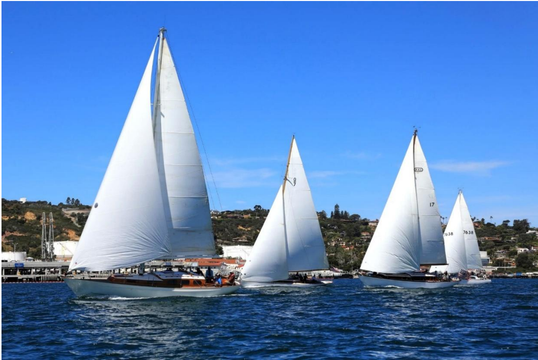
Stella, Falcon, Belle Mer, Lola