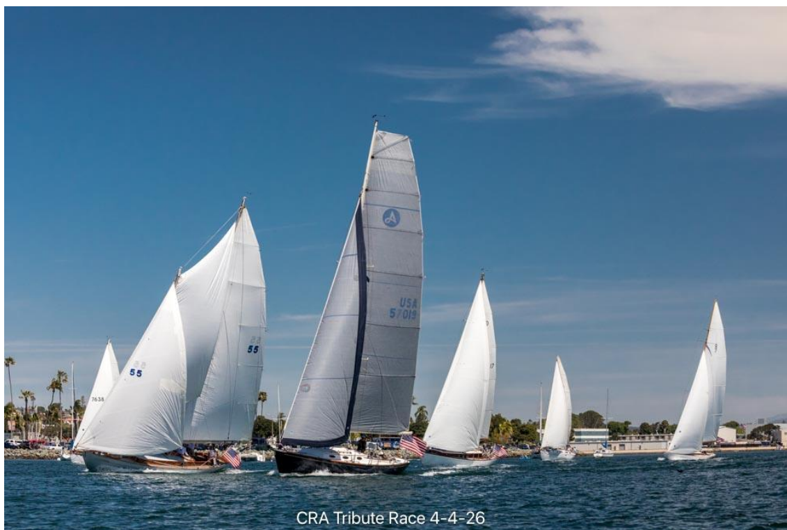
CRA Tribute Race 4-4-26