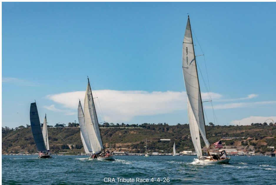
Stella, Zealot, Lola, Belle Mer, Falcon