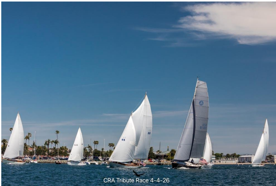
CRA Tribute Race 4-4-26