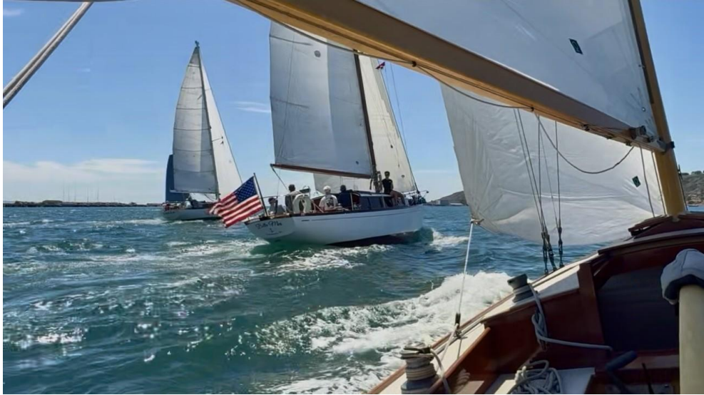
Zealot, Stella, Belle Mer from Falcon